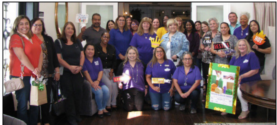
2022 First Place Winner: Alamo Chapter of the APA

Please have photos as JPG or PNG files. Description of photos may be a Word or PDF file. Please compile all aspects of entry into a folder. Make sure the file name contains "NPW Photo Contest" and your chapter's name. Upload folder here: https://filecloud.americanpayroll.org/url/npwcontestentries .